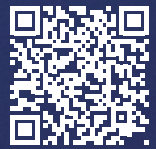
RUTX12 360° VIEW

DUAL LTE CAT6 INDUSTRIAL CELLULAR ROUTER