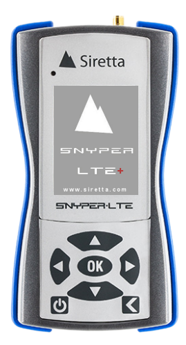
* Neither V1 nor V2 models require a SIM in order to function.

4G/LTE, 3G/UMTS & 2G/GSM Network Signal Analyser