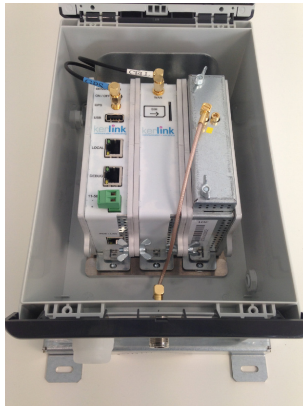
Wirnet™ iBTS Compact