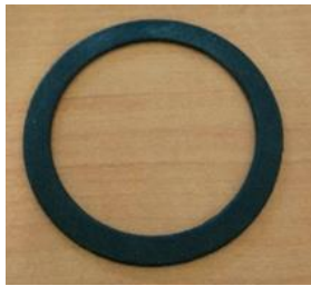
8-5631 TEK 652 Flat NBR Seal Lower Adaptor 55mm