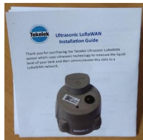
9-5848 TEK 766 Ultrasonic LoRaWAN Installation Guide A5