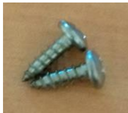
7-5020 No.8 X 13mm PAN POZI SS