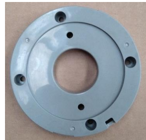
8-5786 TEK 766 Multi-Tread Compression Seal 'Pairing' Adapter – Grey