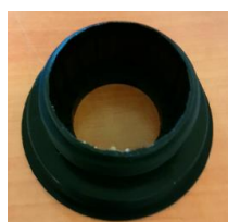
8-5431 TEK595 Adapter (bottom section)