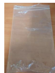
8-5509 Plastic Ziplock bag 190x125