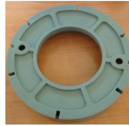
8-5629 TEK652 Mounting adaptor for Tekelek TEK586