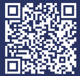
RUTX14 360° VIEW